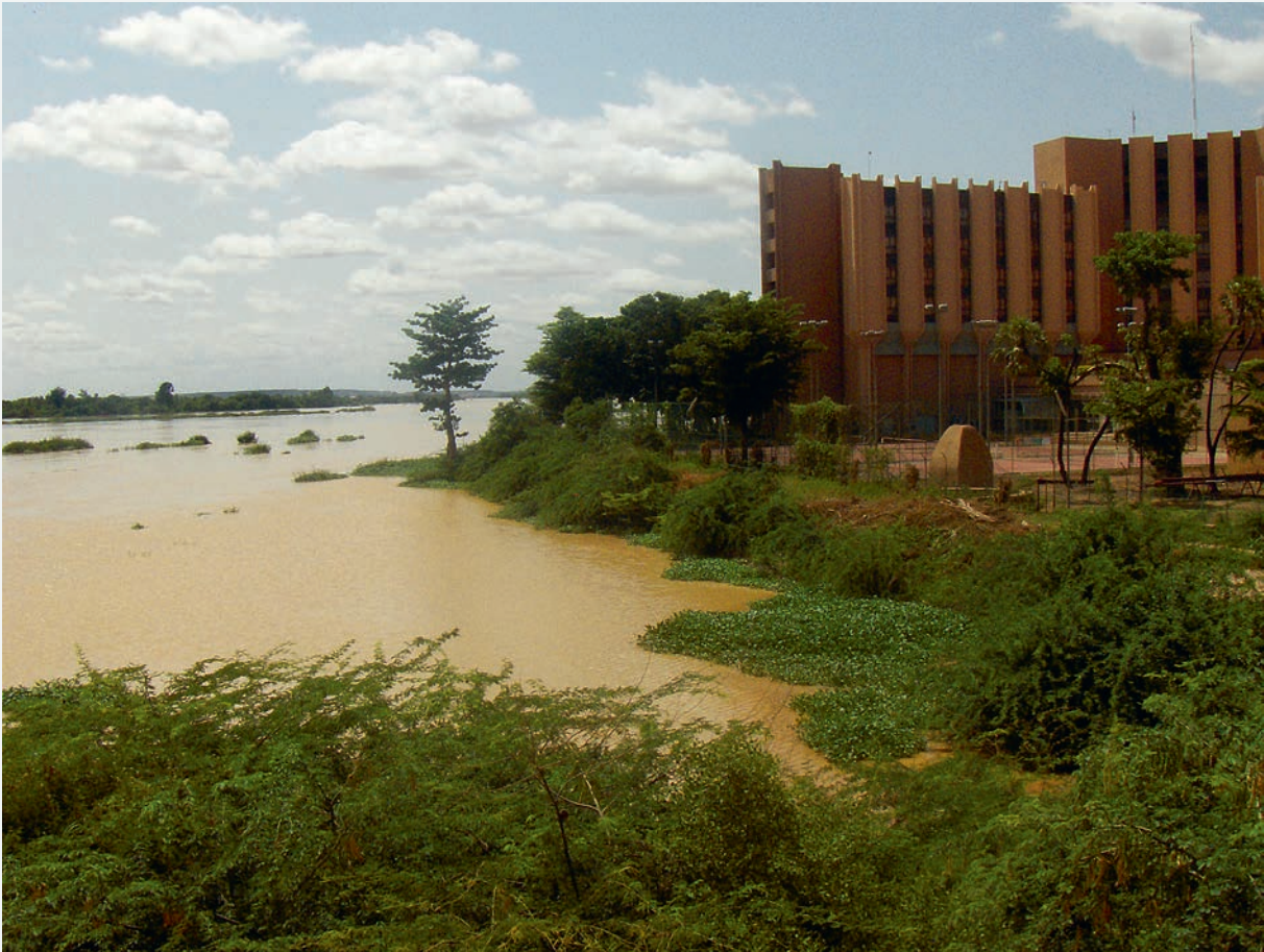
Niger River in Niamey

To adapt to these challenges and increase the resilience of basin populations, several water storage dams are currently under construction, among them, Fomi in Guinea, Taoussa in Mali and Kandadji in Niger. The aim of these dams is to boost hydropower production for economic development, increase water storage for agricultural production and reduce flooding. To harmonize activities around dam building and other national adaptation projects, the basin's RBO, the Niger Basin Authority (NBA), has taken up an important coordination and planning role. For example, the NBA conducted an assessment of the needs and interests of the 9 riparian states' national development activities as outlined in national planning instruments, including NAPs and NAPAs, and subsequently undertook a prioritization of the activities that should be implemented by 2025. This process, which culminated in the Sustainable Development Action Plan (SDAP), also included negotiations and environmental assessments of the above-mentioned dams and arrangements for environmental flows (Earle et al. 2015). Although some disagreements still remain, it is becoming