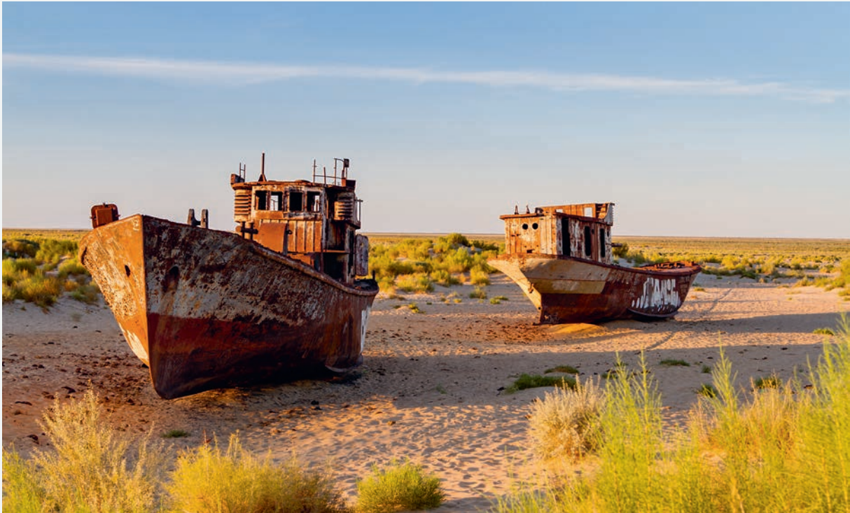
Shipwreck in the Dried-up Aral Sea

Large abstraction of water for agricultural purposes from the Amu Darya/Syr Darya system began during the era of the Soviet Union. Water resource allocation during that time was based on a fixed allocation mechanism according to which 46% of the water was allocated to Uzbekistan, 44% to Kazakhstan, 8% to Tajikistan and 2% to Kyrgyzstan. The largest share of releases was to be made during the summer months (when irrigation needs were highest) and to be reduced to only a quarter during the winter (World Bank 2004). After the breakdown of the Soviet Union, the newly independent states entered into an agreement in 1992 guaranteeing their adherence to the allocation system of the Soviet era and furthermore established the Interstate Commission for Water Coordination in Central Asia (ICWC) to manage and oversee the distribution of water resources between the five countries.