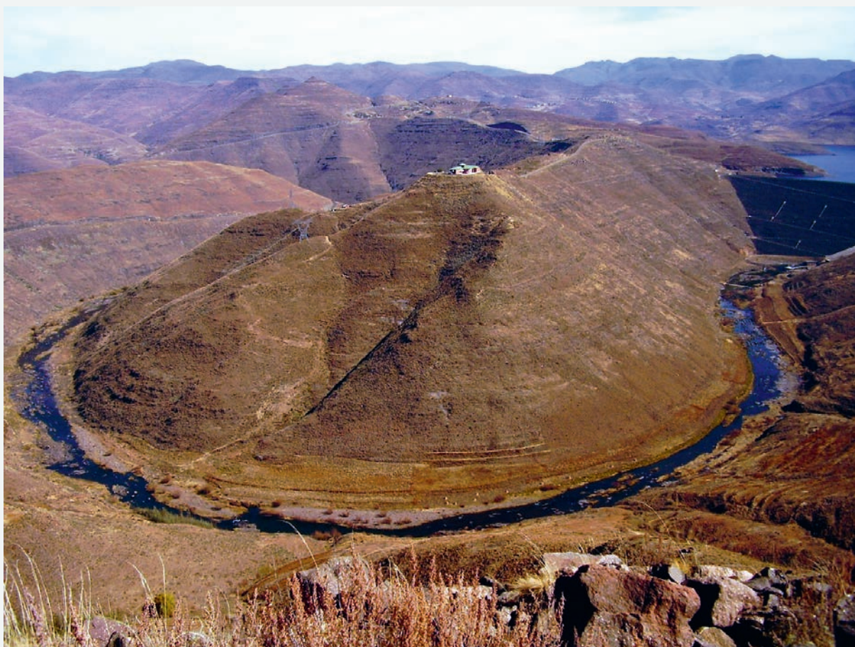
Senqu River behind Mohale Dam in Lesotho

(ORASECOM) – the regional RBO which is very active on environmental issues – commissioned such a study. In this study, researchers for the first time modelled climate change scenarios and implications for river flow in the Orange-Senqu Basin ( ORASECOM 2011 ). The results of this modelling show an average increase in temperature between one to two degrees in different parts of the basin. Rainfall is expected to slightly decrease in most mid-stream and down-stream areas and increase in the upper stream, the Lesotho Highlands ( Ibid: 6–10 ). The translation of these projected climate changes into runoff generation is very difficult and scenarios are consequently very uncertain. According to the study, river runoff is likely to increase in the Lesotho part of the basin and the source of the Caledon River in South Africa, whereas other tributaries in the Lower Orange-Senqu are likely to experience a decrease in runoff. However, the study also found that increasing runoff in the source areas could possibly outweigh decreasing runoff in the drier downstream areas ( Ibid: 17 ).