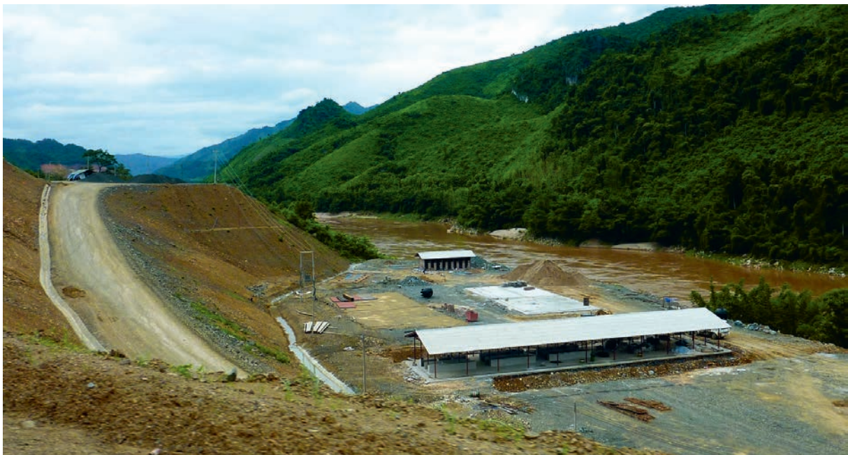
Construction Site of the Xayaburi Dam

and increase water storage capacities as a buffer against flow variability. However, they are mainly realized in the upstream parts of a basin. Depending on their operation, they may decrease water availability and change water seasonality in the downstream parts as well as threaten the availability of fish and other water-related resources. The best-known examples for contentious dam projects in transboundary basins include the Grand Ethiopian Renaissance Dam (GERD) along the Nile, which is opposed by Egypt for fear of temporarily or permanently reduced inflows into its territory, as well as the Xayaburi dam (built in Laos) on the Mekong main stem, which will, among other things, impact the availability of fish resources in Vietnam (a main source of livelihoods in the country). In both cases, the construction of these hydro-power dams has caused considerable problems in bilateral relations.