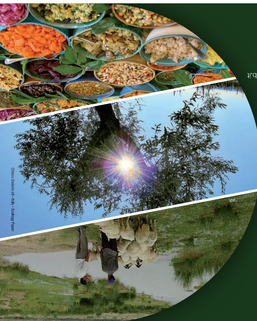
Chieco Sistemi srl - Italy - Ecology Paper