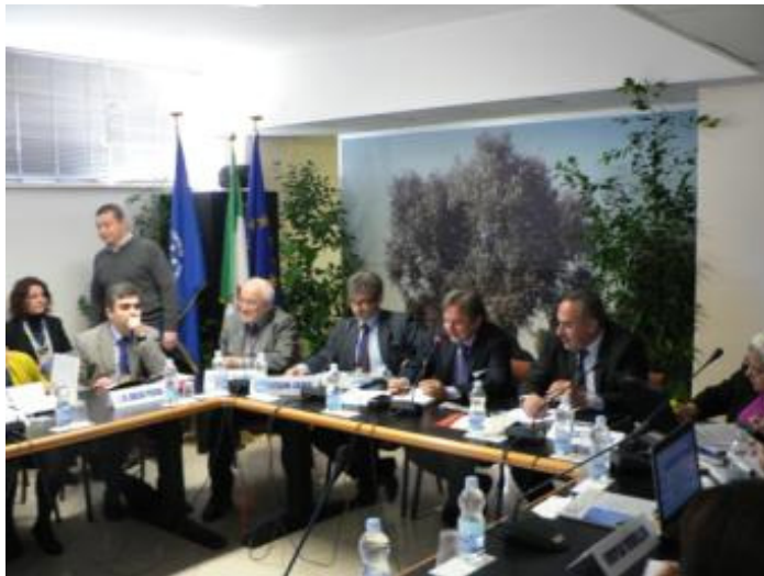
Fig. 2 – Welcome speech of IAMB Director