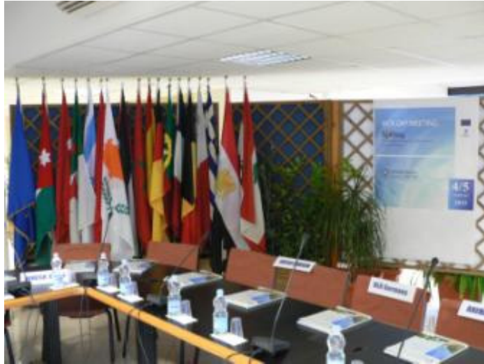
Fig.1 – Setting up of the meeting room