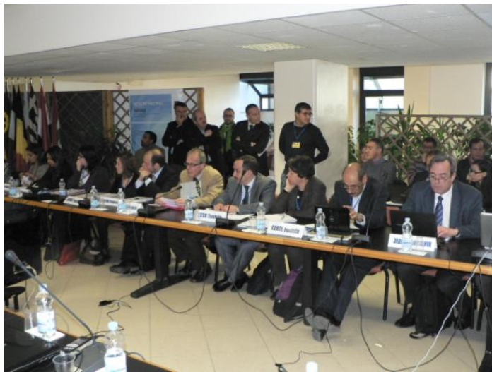
Fig.5 – Participants to the plenary session