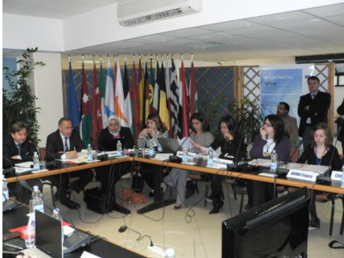
Fig.4 – Participants to the plenary session