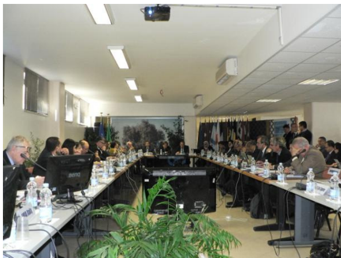
Fig.6 –Panoramic of the plenary session